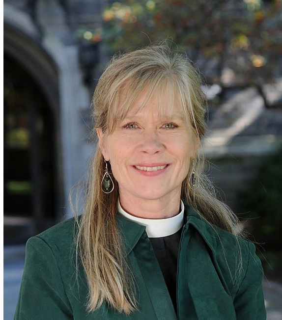
Chaplain for The Cathedral School Canon for Education at the Cathedral of Saint John the Divine

A chief joy of our 150 th Anniversary celebrations is inviting back former clergy who have served here at Immanuel.